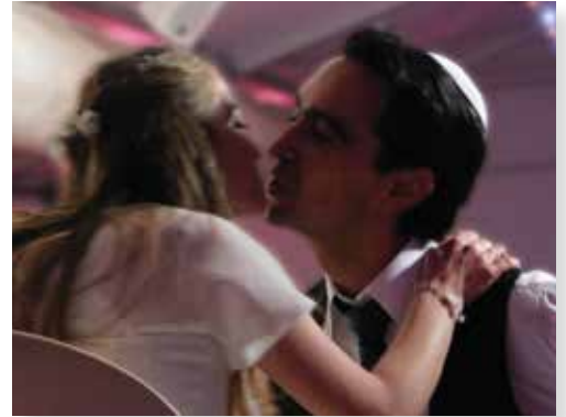
Now my beloved is mine