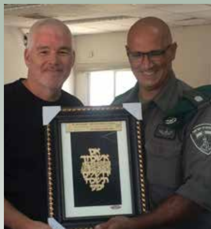
Recognition award for donations