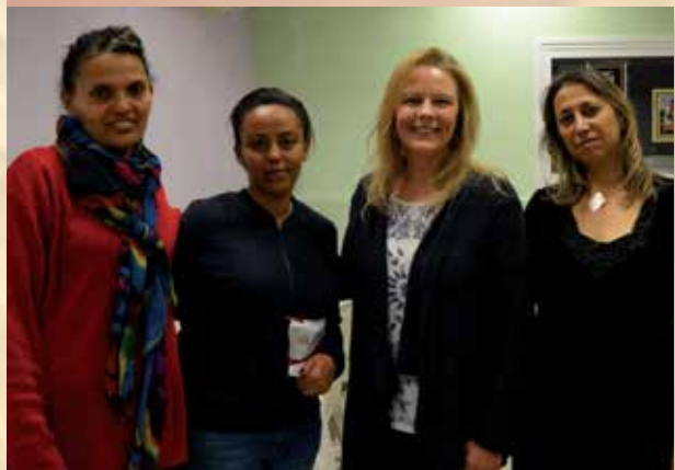
Bringing love and encouragement

"Bear one another's burdens — in this way you will be fulfilling the Torah's true meaning, which the Messiah upholds" (Galatians 6:2, CJB).