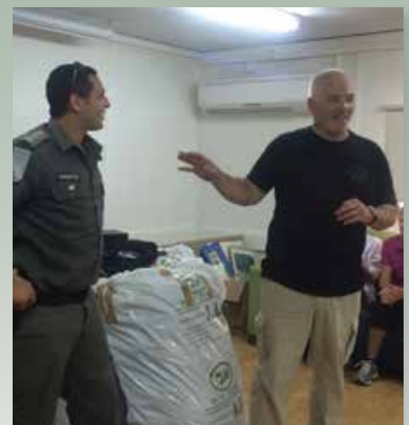
Speaking to Israeli soldiers