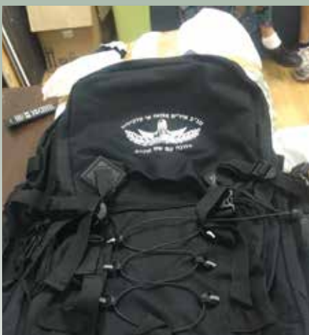
Special IDF backpacks