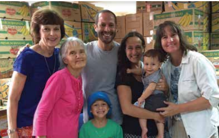
Jews and Christians together at last