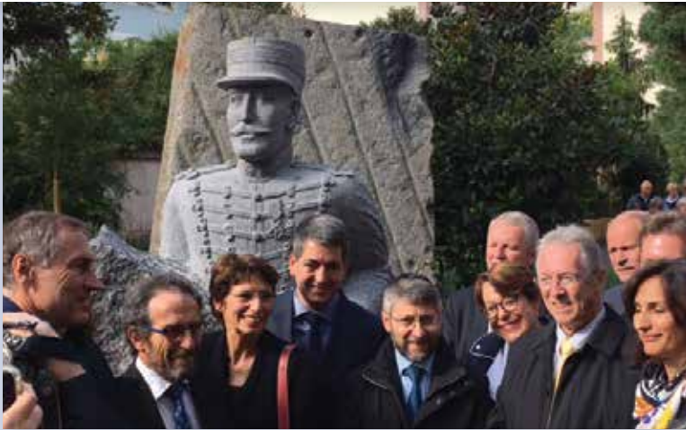
Other Representatives present with the Chief Rabbi