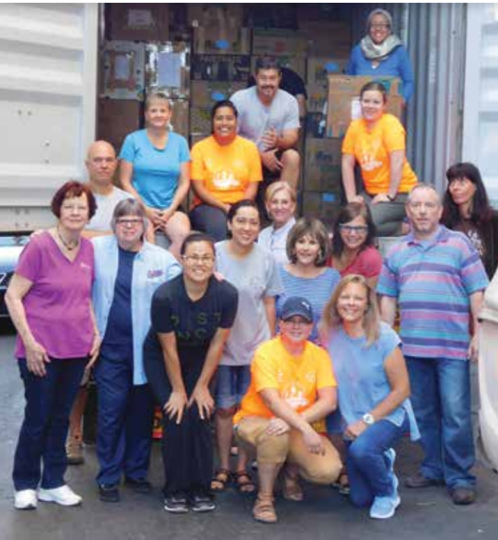
UK Shipment (from Olive Grove Projects, Luton, England) arrived on the heels of the US shipment.