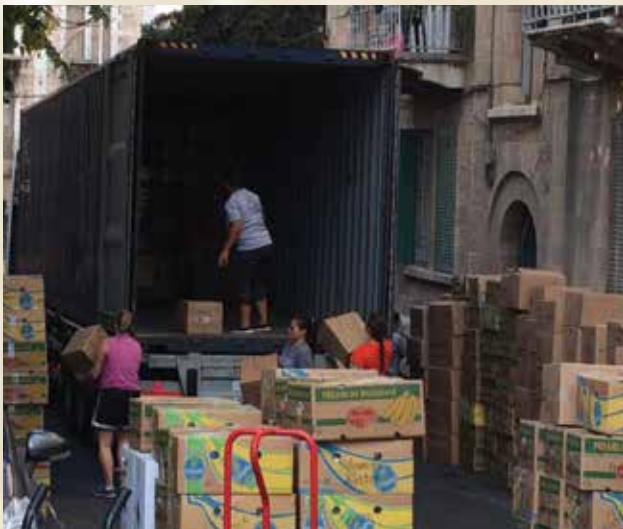
USA Shipment (from H.E.L.P. International, Colorado)