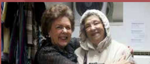
Assisting the elderly

People who are hurting, bogged down with burdens, carrying heavy loads of debt, the aged who are lonely and feel forgotten, single mothers with children who do not know where to turn and those devastated by sorrow and grief for a multitude of reasons, need our strength and support. When we offer comfort to Jewish people of all ages and backgrounds, we reach out to be comforters, emulating the One we follow. We live in the midst of a host of hurting people. Our task requires tender hearts of mercy and compassion enough to support and strengthen those who often have no one to which they can turn. Thank you for helping us to reach out and shed God's light in the darkness of many lives. "He who has pity on the poor lends to the Lord, and He will pay back what he has given" . (Proverbs 19:17).