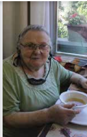
Calling on the often forgotten