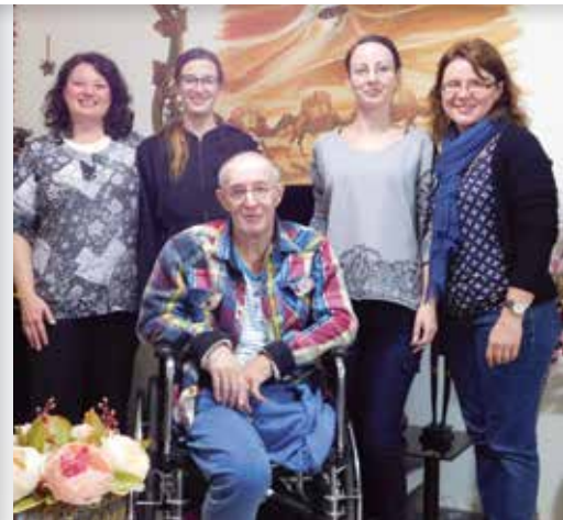
Visiting the disabled and homebound