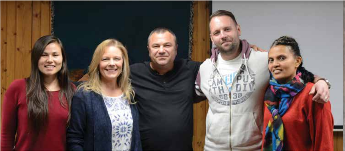
Helping those who help others