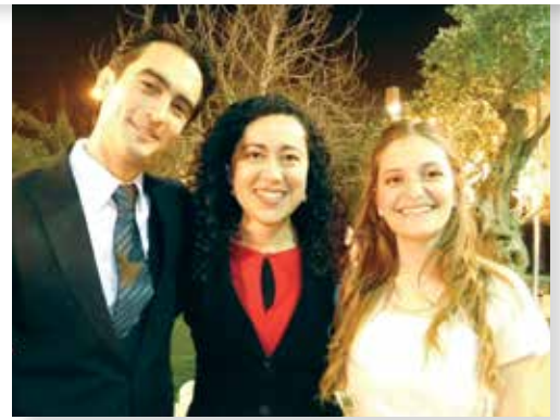
Smiles at the wedding ceremony