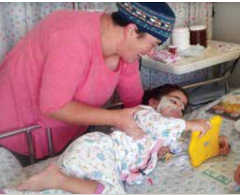
Visiting those in hospital