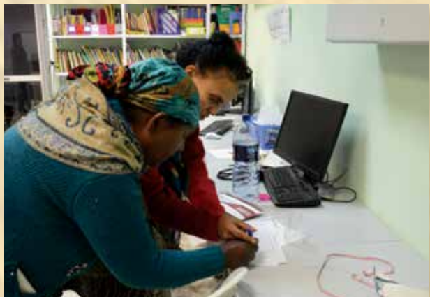
Vouchers for impoverished families