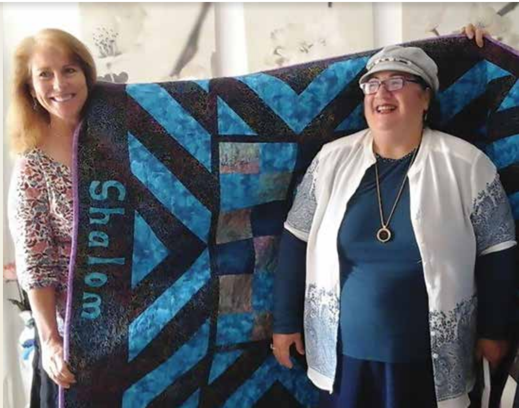
Wrapping those recovering in peace and love