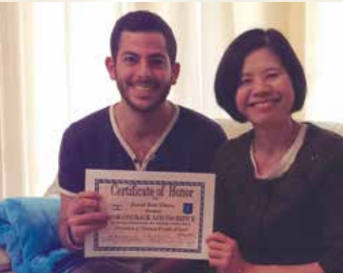
Special award presentation