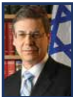
Danny Ayalon Former Israeli Ambassador to the USA