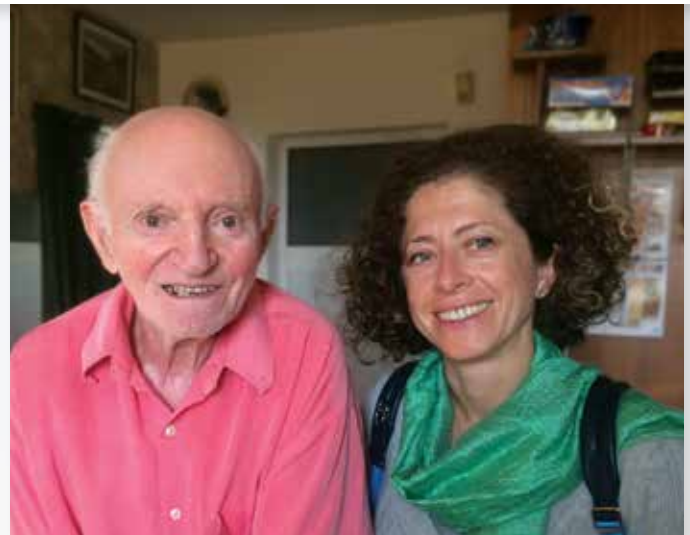
The joy of sweet fellowship