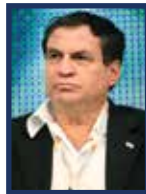
Uzi Dayan IDF General and War Hero (retired)