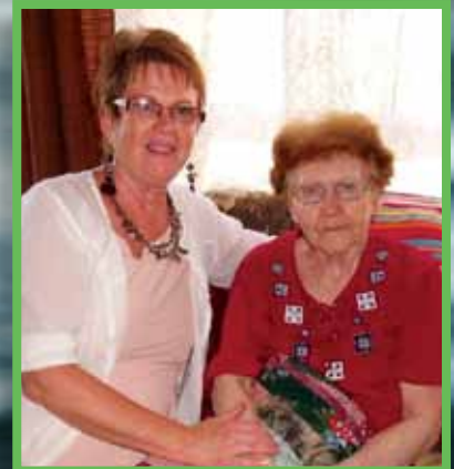
Comforting a war survivor

BABE IN ARMS —It has been said: "when you save just one life you save the entire world."