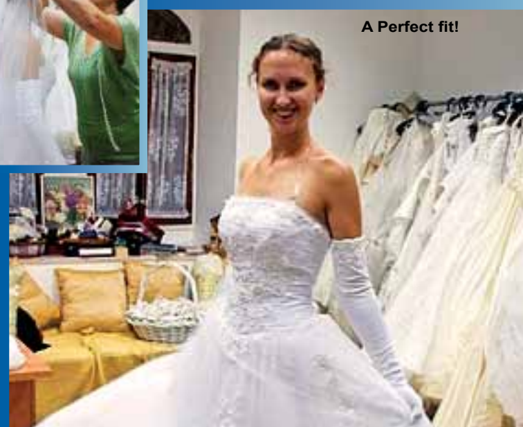
A Perfect fit!