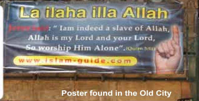
Poster found in the Old City