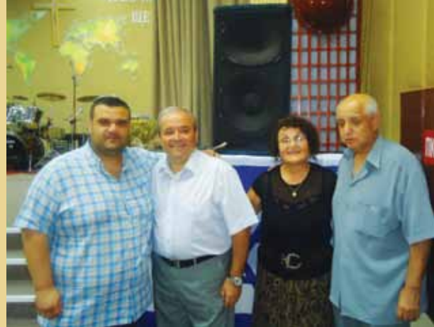
Above: Building bridges with the Jewish Community