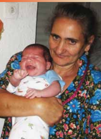
Born into constant rocket fire