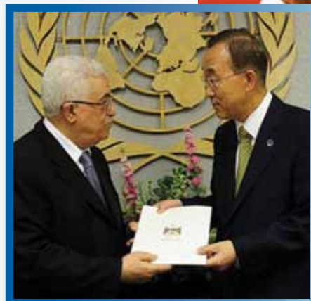
Nations trying to give the Land of Israel away

"Keep not thou silence, O God; hold not thy peace, and be not still, O God. For, lo, thine enemies make a tumult; and they that hate thee have lifted up the head. They have taken crafty counsel against thy people, and consulted against thy hidden ones. They have said, Come, let us cut them off from being a nation; that the name of Israel may be no more in remembrance. For they have consulted together with one consent; they are confederate against thee." Psalm 83:1-5