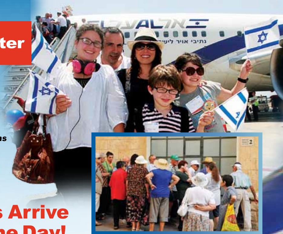
Crowds arrive at CFI's newly renovated D.C.

It is because of the faithfulness of our supporters in the nations that we can continue welcoming the Jewish People whom the God of Israel is bringing back to their homeland. We're quick to explain to all of our new friends who visit the Distribution Center Lighthouse the desire of Christians around the world to express their love and solidarity with each of them. They are amazed and sometimes surprised to see such love from all over