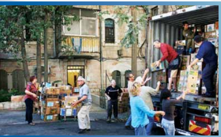
Unloading Shipments Together For His Glory

“This Center was first dedicated in 1991 during the Gulf War. It has now been rededicated in July 2011. A lighthouse is a place of safety from the storms of life. All that is given freely from this Lighthouse has come as a token of love from Christians around the world who love Israel and the Jewish People.” These words, in English, Russian and Spanish, are beautifully designed on a sign located in the Welcome Area of our newly remodeled CFI Distribution Center in the center of Jerusalem, greeting the people as they enter. As the graphics depict and the text defines, the CFI Distribution Center Lighthouse will continue in its purpose to provide the Jewish People with compassionate and practical support in order to undo damage done in the name of Jesus for centuries.