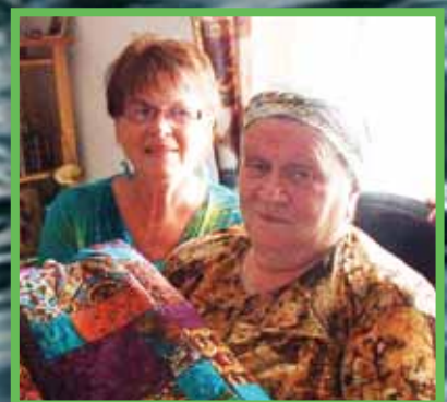
Giving a blanket to survivor