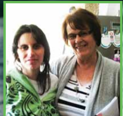
Help for a single mom