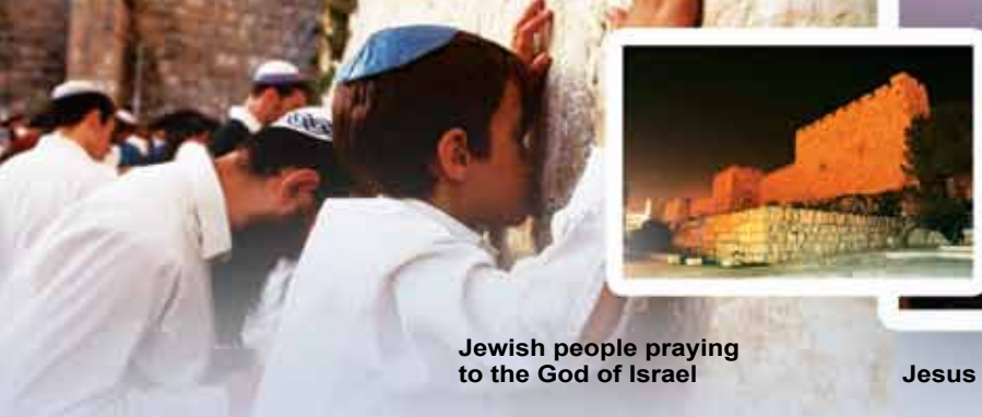
Jewish people praying to the God of Israel