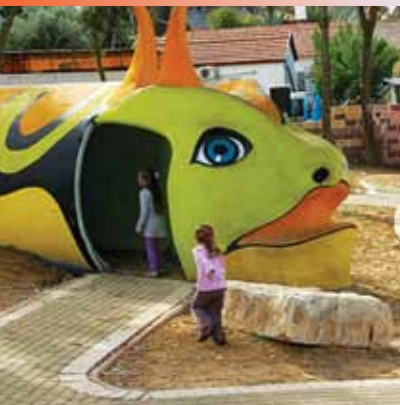
Bomb shelter in playground