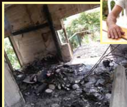
Charred ruins: Once a Home