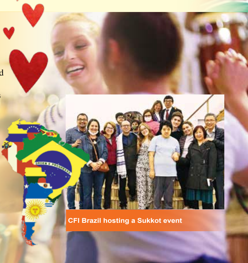
CFI Brazil hosting a Sukkot event