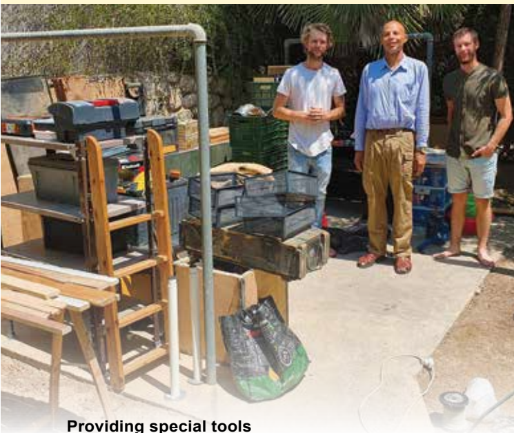
Providing special tools

Upon my return to my project duties from a visit with family, I immediately engaged in making certain that the assistance that our CFI partners, from all around the world, generously provide were sown into the lives of believers in the Land. Our featured recipients of God’s Blessings in this article have one thing in common besides their faith in Messiah: they each have received two-fold assistance from us. Because of this principle, we expect that each of these individuals will reap the benefits of serving a Living and Benevolent God, as they conduct their daily lives as believers.