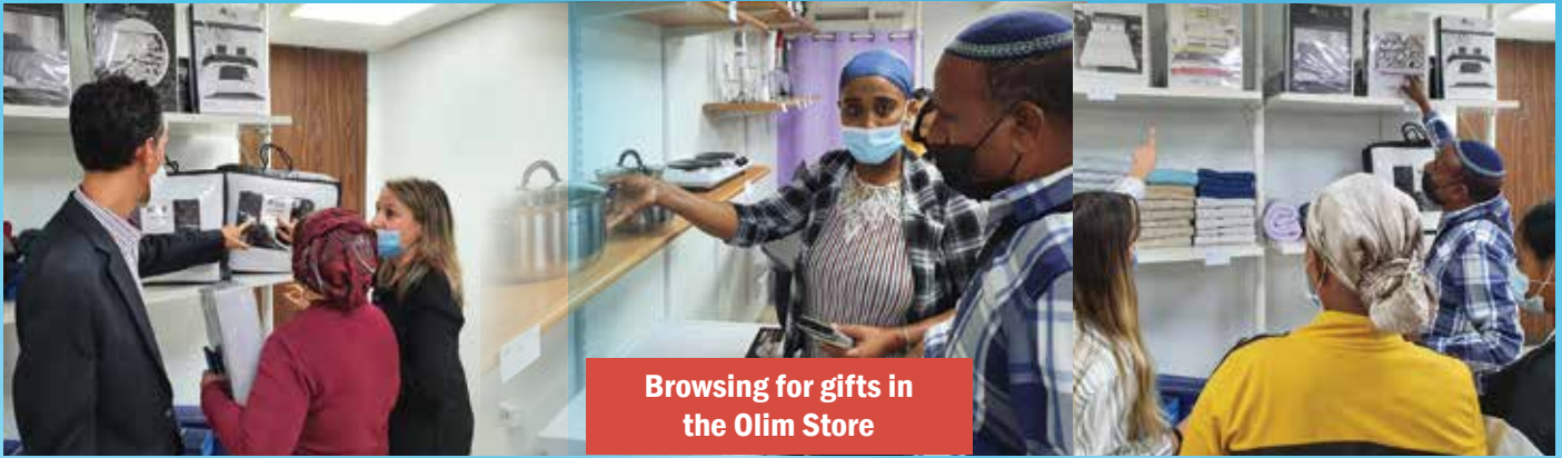
Browsing for gifts in the Olim Store

Jewish immigrants are making Aliyah to Israel in significant numbers, some wanting to come and some escaping oppression. Biblically, immigration plays a central part in God's end-time purposes and it seems He is "shaking" His People from the kingdoms of this world (Ezekiel 36:24-26). CFI is working with Jewish Agency Absorption Centers across Israel and helping the "poorest of the poor" newcomers.