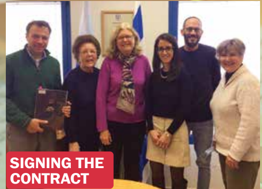
SIGNING THE CONTRACT

CFI Leadership with Developer, Lawyer, and Contractor