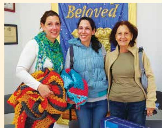
New immigrants from Venezuela Ethiopians visiting from Beesheva