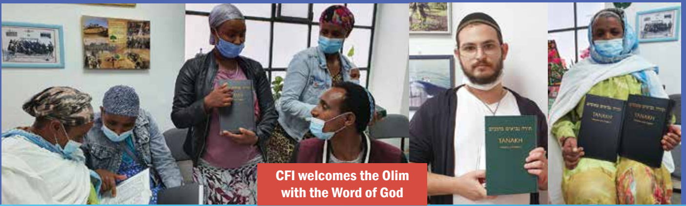
CFI welcomes the Olim with the Word of God