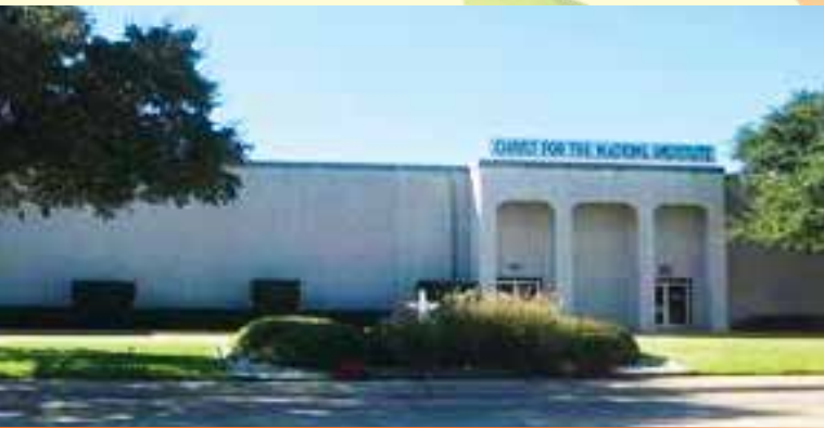
Christ for the Nations Bible College