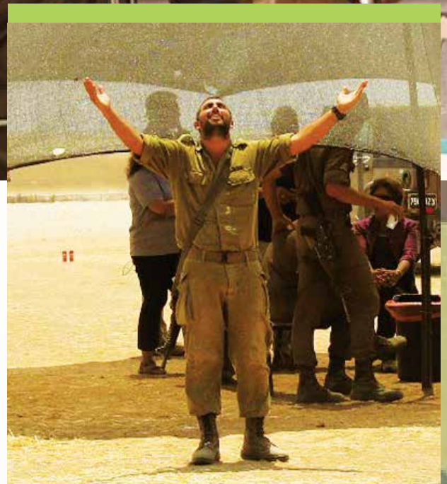
IDF soldier knows His Protector

Project David's Shield shield@cfijerusalem.org