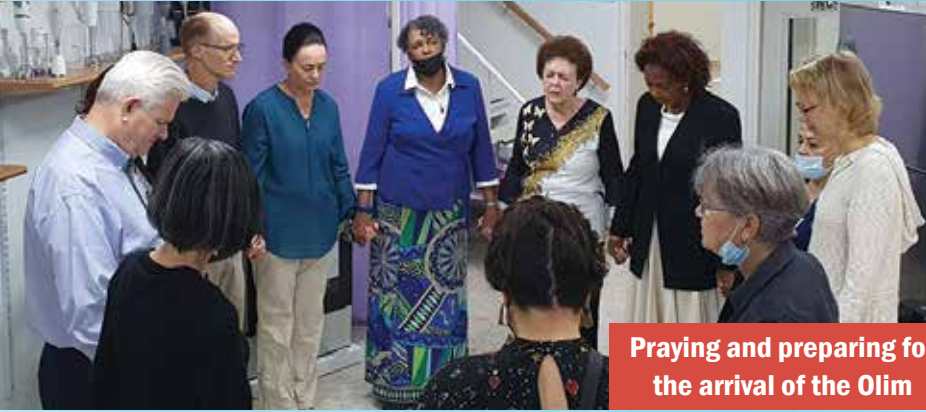
Praying and preparing for the arrival of the Olim