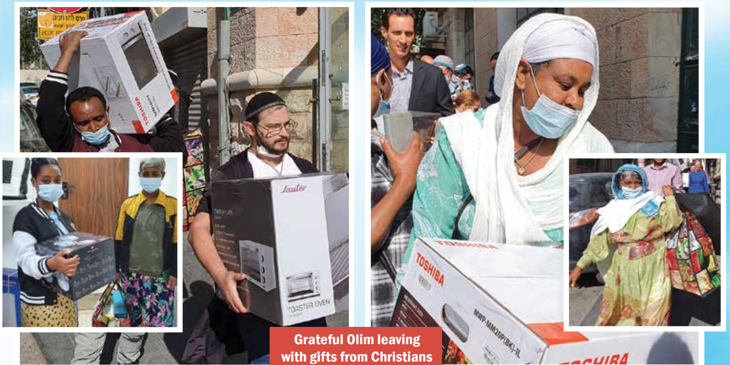
Grateful Olim leaving with gifts from Christians

Presently, we need assistance to help us serve the Ukrainian Jews as they arrive to Israel. We are identifying the most urgent needs they will have as many will be tired refugees from exhaustion and distressed experiences. The CFI Distribution Center will once again be a conduit to help Jewish people coming from oppressed lands. You can find wire transfer information inside the front cover page of this magazine.