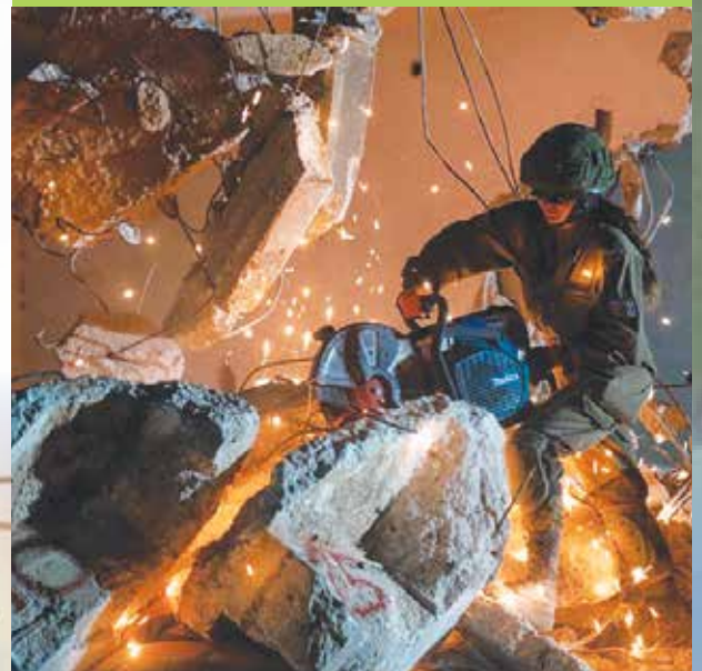
Clearing debris from a rocket attack