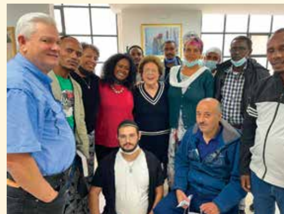
Welcoming new immigrants

"I will make an everlasting covenant with them: I will never turn away from doing good for them... I will delight in doing good for them, and with all My heart and all My soul I will in truth plant them in this land."