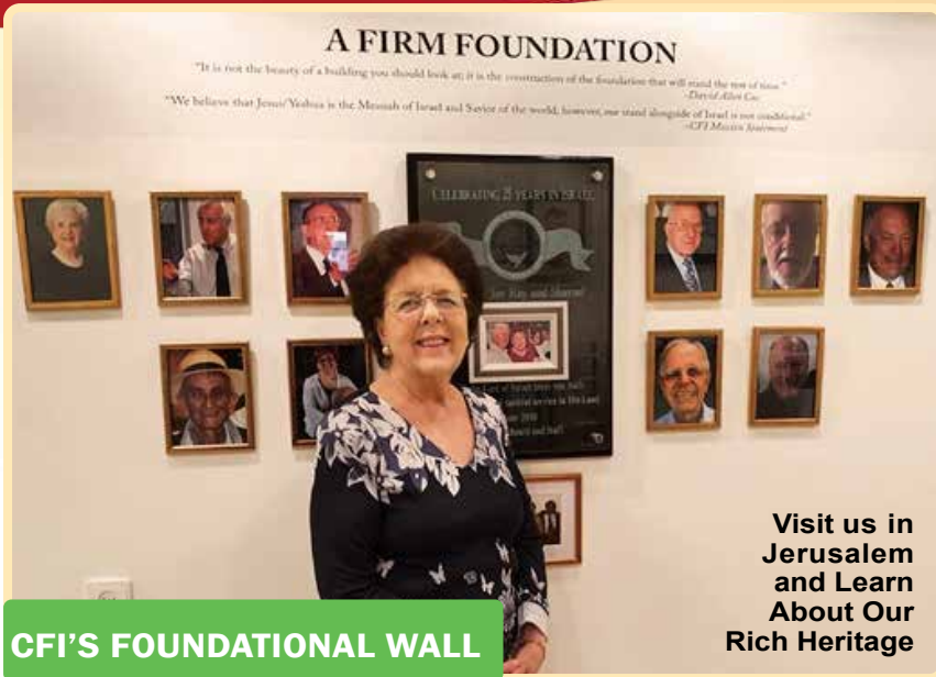
CFI'S FOUNDATIONAL WALL

Visit us in Jerusalem and Learn About Our Rich Heritage