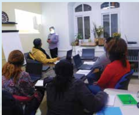
Remembering the Poorest Communities

ing the impossible becoming possible. The stakeholders and representatives gave us such encouragement and purpose to accomplish our initial goals: supporting, serving, and empowering the Ethiopian community. The “Hope Resource Center” is equipped to provide introductory short courses in computer literacy for the Ethiopian community in Israel. In the next cycle,